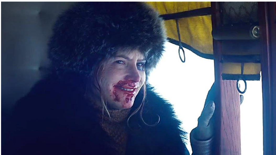
Fig. 6. Jennifer Jason Leigh as Daisy Domergue in The Hateful Eight (2015).

Since her behavior as a woman is not consistent with the social conventions at that time and, hence, not considered as feminine, she is not treated like a lady, respectively a woman. As a result, Warren and especially Ruth do not hesitate to hit her. This becomes apparent after the first eleven minutes of the film when Daisy questions Ruth's decision to give Warren a ride. He silences her with a blow on her head and threatens to knock out Daisy's front teeth if she opens her "trashy mouth" again. Daisy is pictured in a close-up with blood running down her temple while confirming that she understood. It stands to reason that her black eye is probably given by Ruth as well. Not even four minutes later, Daisy provokes and insults Ruth by stating that Warren overrates him since he is "like a man who took a high dive in a low well" at which he elbows her in the face. At first, Warren is startled but starts to laugh about Ruth's measures to bring her to obedience. Yet, Daisy reacts to their laughter by smiling at Warren with a wink and licking the blood on her lips (Fig. 6.). Her smile, though, suggests that she can take a fair bit of punishment and further effects that she does not cut a pitiful, pathetic figure.