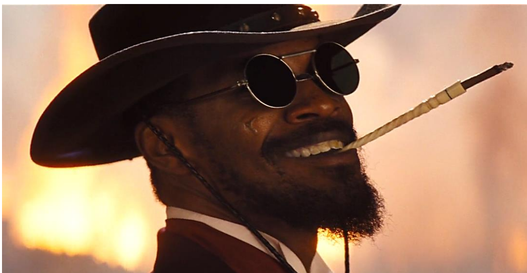
Fig. 5. Jamie Foxx as Django in Django Unchained (2012).

Once Django has successfully rescued her from Calvin Candie's plantation, he blows up Candyland while Broomhilda awaits him on horseback in front of the mansion. He is represented as the man of the hour, who puts on his fashionable sunglasses to watch the detonation from up close while smoking with a cigar holder. He stands still with his arms akimbo, whereas Broomhilda covers her ears and winces while her horse whinnies as the mansion explodes. She is relieved and claps her hands with joy as Django turns to her with a winner's smile (Fig. 5.). He calls her again "little troublemaker" whereas Broomhilda, filled with pride, salutes him with a smile and refers to him as "big troublemaker" before Django courts her with horse tricks. Their nicknames ultimately show that their characters do not meet on an equal footing. While Broomhilda is in a subordinate position and functions merely as a love interest, Django is hailed as a hero.