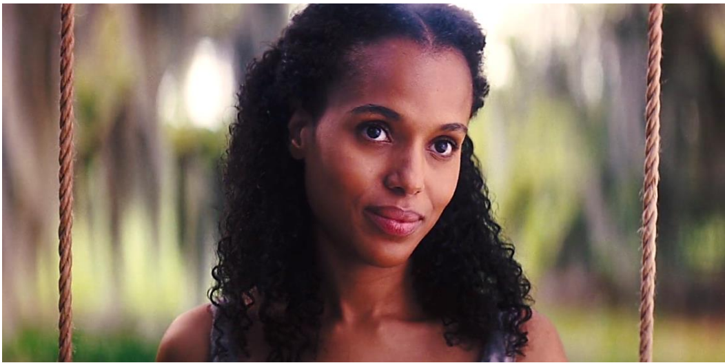
Fig. 4. Kerry Washington as Broomhilda in Django Unchained (2012).

Kerry Washington plays the black female main protagonist, Broomhilda Von Shaft. She is Django's wife and mentioned for the first time as Django tells Schultz that he is married and wants to find her. He explains further that she was raised by a German mistress, who taught her a bit of German when she was little. A flashback shows Broomhilda sitting on a swing in a beautiful garden polishing some objects. She smiles dreamy-eyed and says that they use to call her Hildi, followed by a sanguine upward glance, which suggests that her future looks bright (Fig. 4).