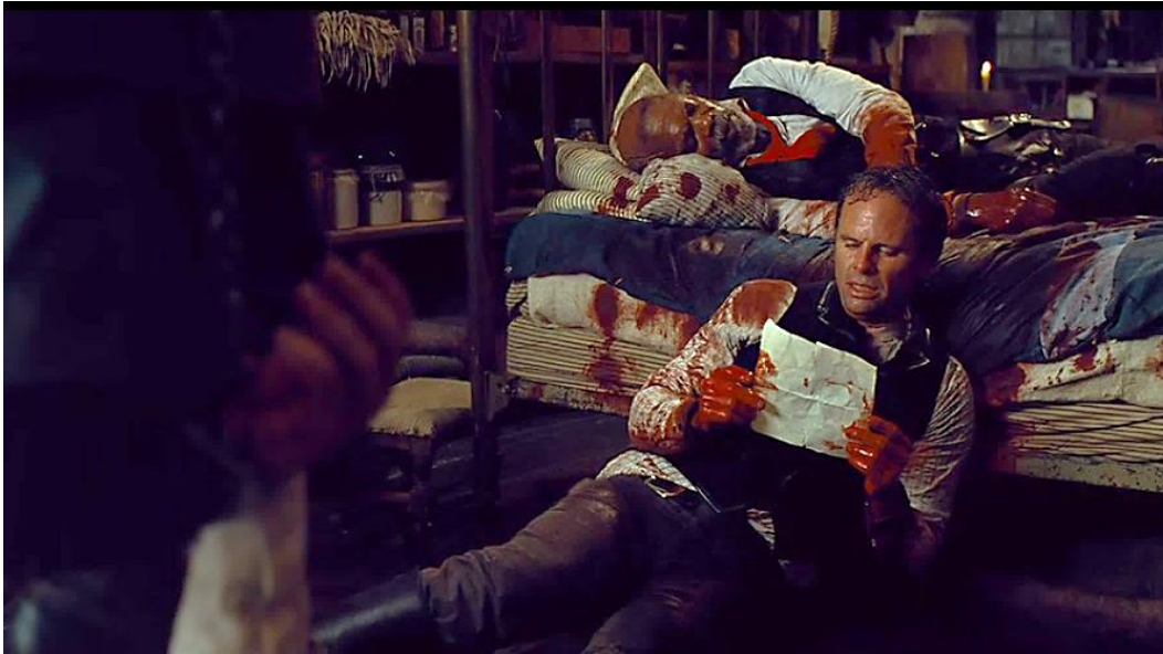
Fig. 5. Walton Goggins as Chris Mannix and Samuel L. Jackson as Major Marquis Warren in The Hateful Eight (2015).