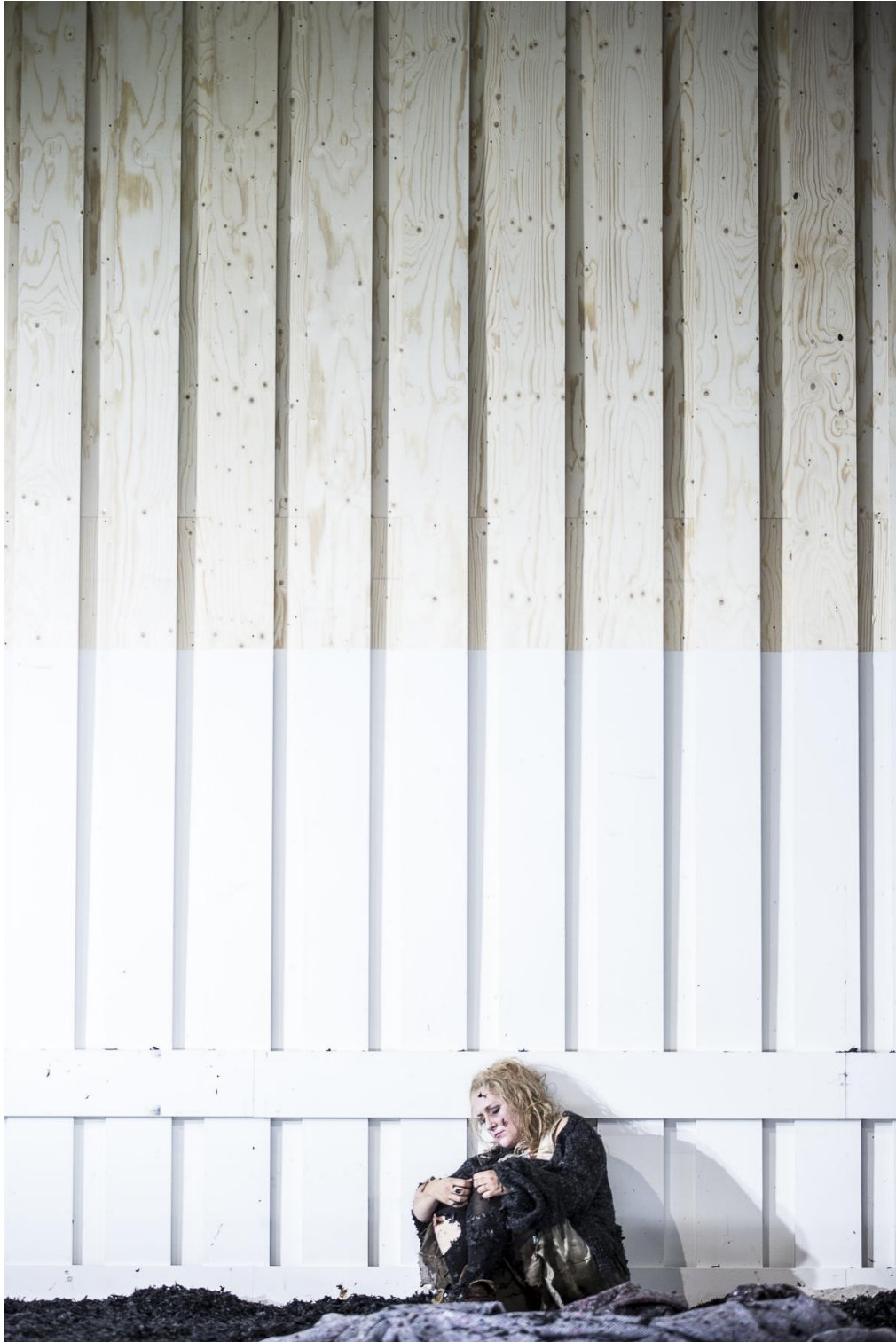
Diana Damrau as Moll Hackabout in Iain Bell and Peter Ackroyd's A Harlot's Progress: world premiere at Theater an der Wien, October 2013